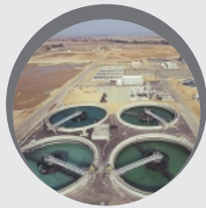
Water & Wastewater