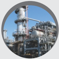
Oil & Gas - Onshore