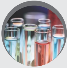
Chemical & Fertilizer