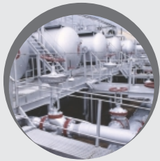
Refining & Petrochemicals