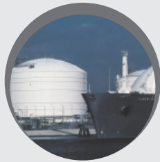
LNG & Cryogenics