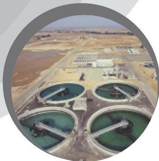
Water and Wastewater