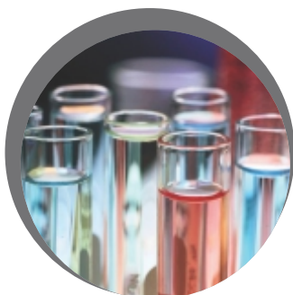
Chemical & Fertilizer