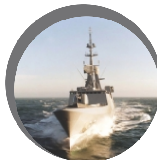
Naval & Marine