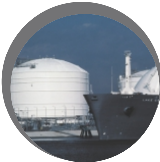
LNG and Cryogenics