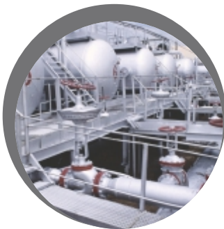
Refining & Petrochemicals